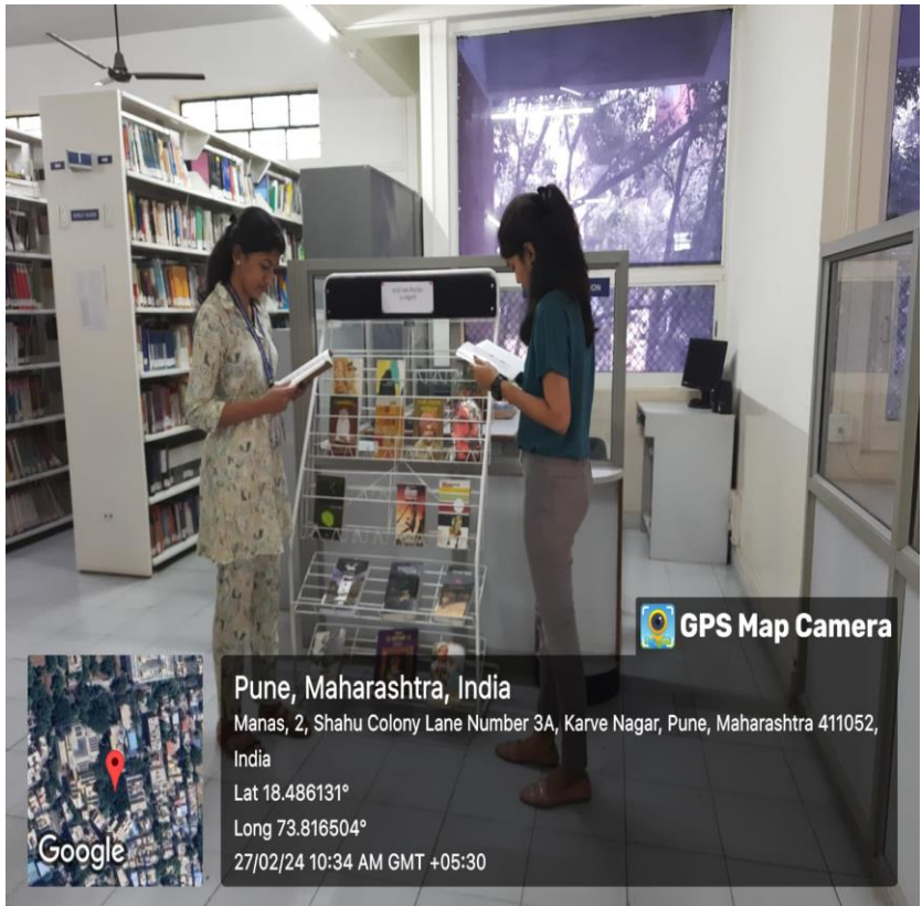
Students at Book Display during Marathi Bhasha Gaurav Din