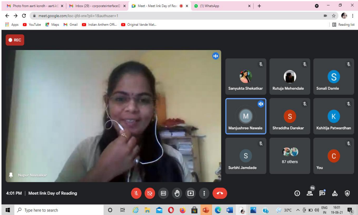
HNIMR Student participation on the occasion of Vachan Din, 19 th June 2021