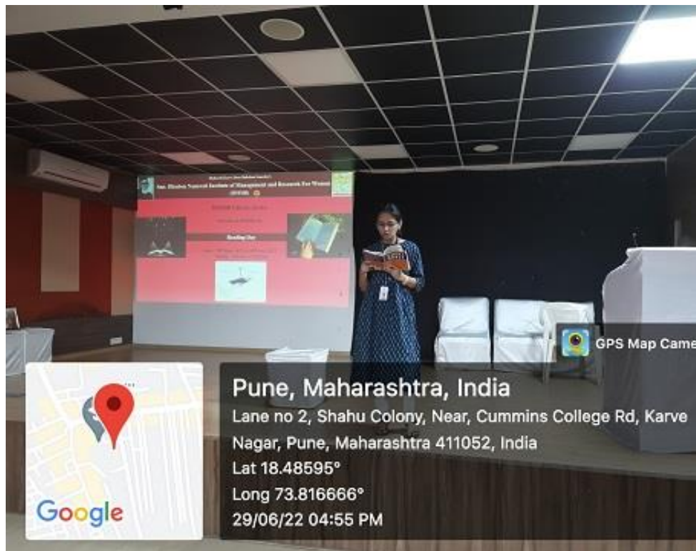
Reading day Photo 4