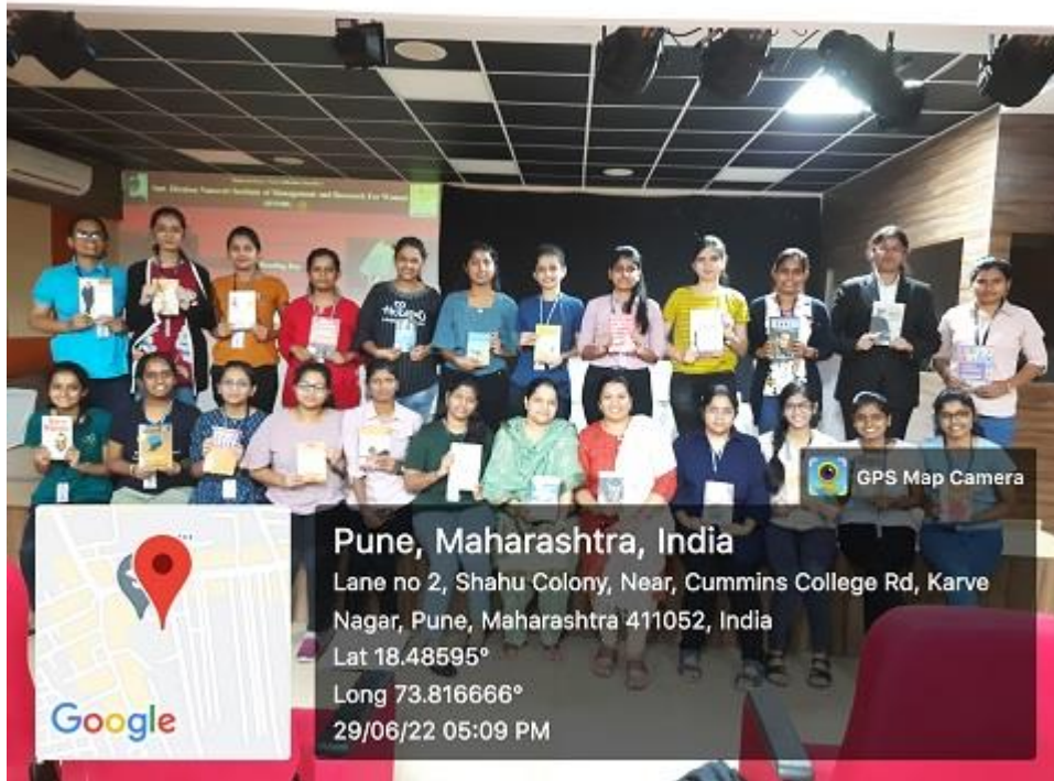
Reading day Photo 3