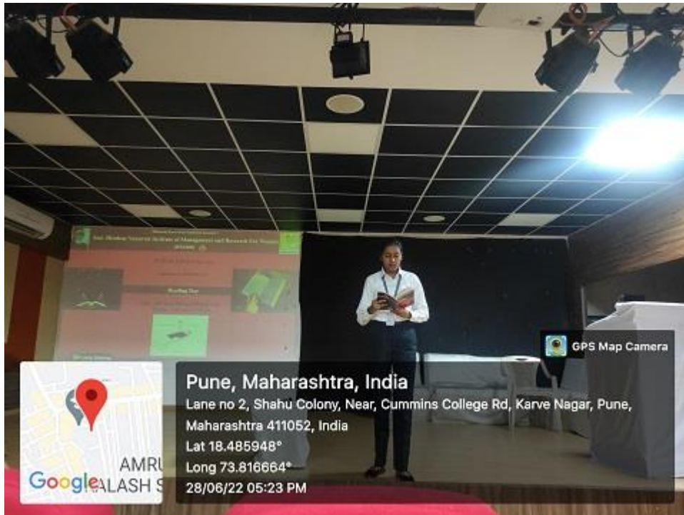
Reading day Photo 1