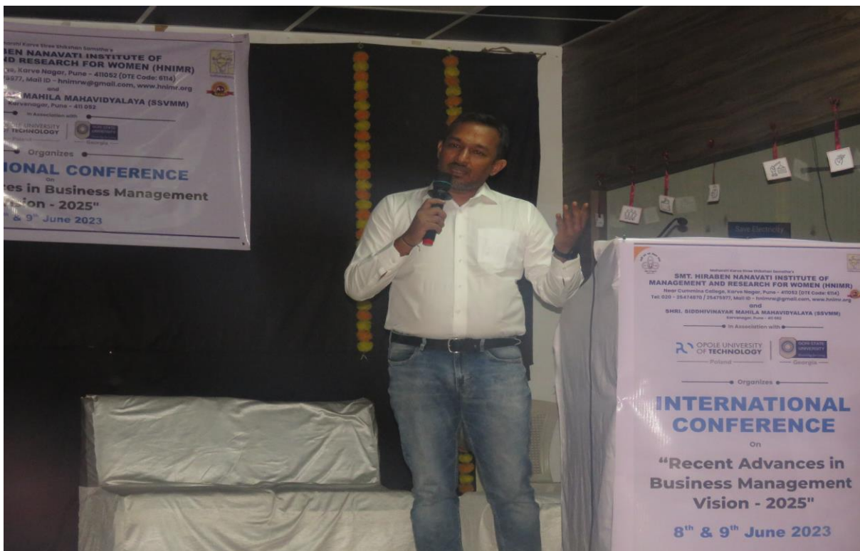
Research Paper Presentation