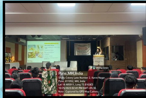
Glimpses of Business Plan Competition