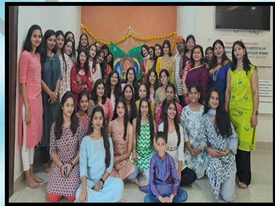
Ganeshostav celebration with great zeal and devotion