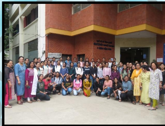
A glimpse of induction program