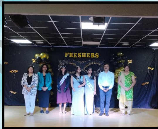
Winners of fresher's party with Judges, Director and LMC Chairman of HNIMR.