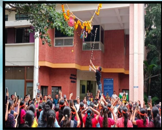
Students enjoying Janmashtami at college campus