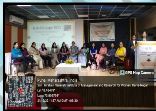
Warm welcoming of all the alumnae of HNIMR