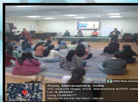
Workshop on Yoga and Meditation