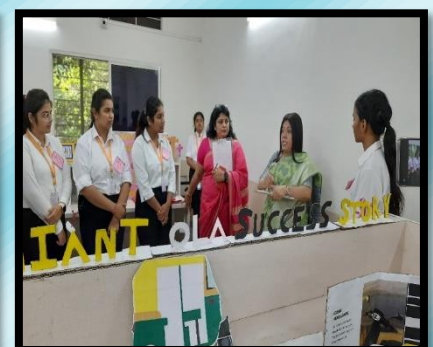
Glimpses of Poster Presentation Competition