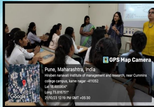
Interactive sessions with alumnae

To summarize "Tracing the Footprints" on October 21, 2023, was a successful event, creating meaningful connections between past and present students and providing a platform for knowledge exchange and mentorship.