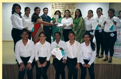
Winning team of Bookshelf 2018