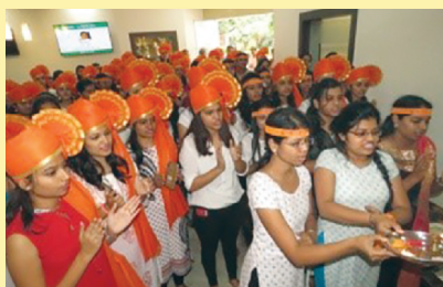
Ganpati Aarti at HNIMR