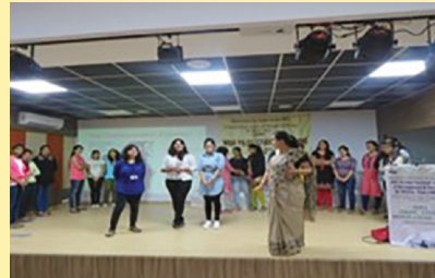
Activity on communication session for MBA student