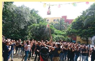
MBA student enjoying the Dahi Handi event at HNIMR

On 4th September 2018, the institute celebrated Janmashtami festival. A Dahi Handi competition was held between the MBA junior and senior students. Everyone had a merry time including students as well as teachers. This event is conducted every year as a tool to develop 'Team building and Competitive spirit' among students.