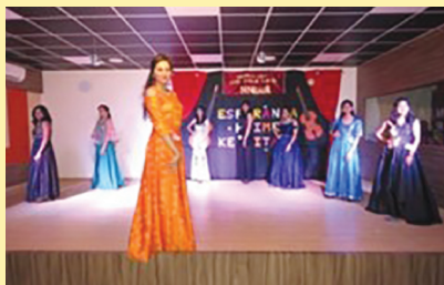
Participant at the ramp walk round