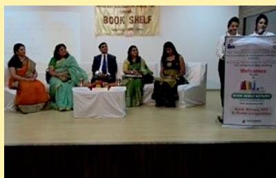
Dignitaries at the inaugural of Bookshelf 2018