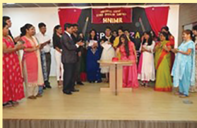
Fresher's Party 2018