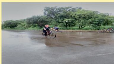
Srushti Kokate (Road Race Cycling)